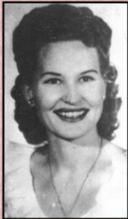
At age 25