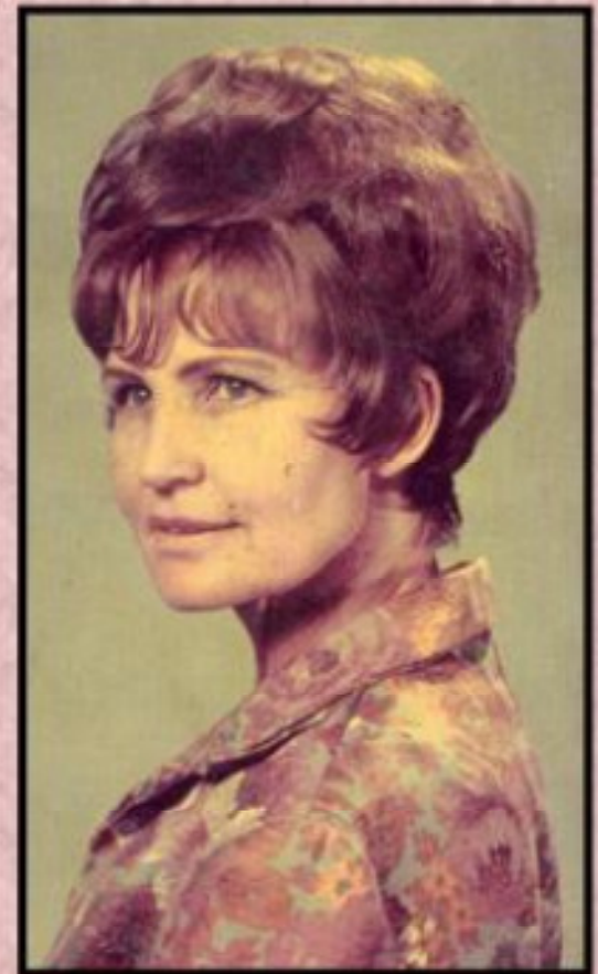
at age 45