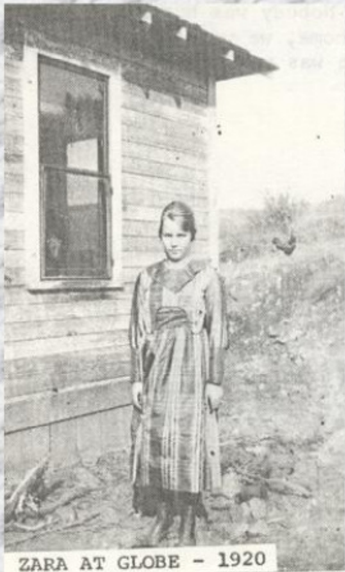
ZARA AT GLOBE - 1920