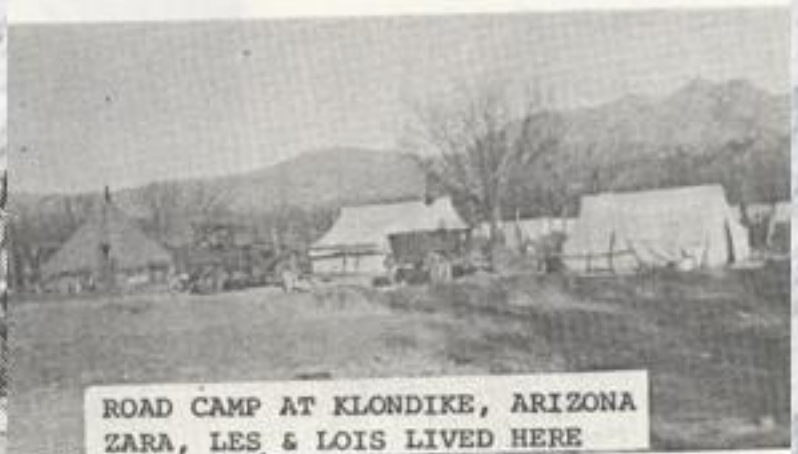
ROAD CAMP AT KLONDIKE, ARIZONA ZARA, LES & LOIS LIVED HERE