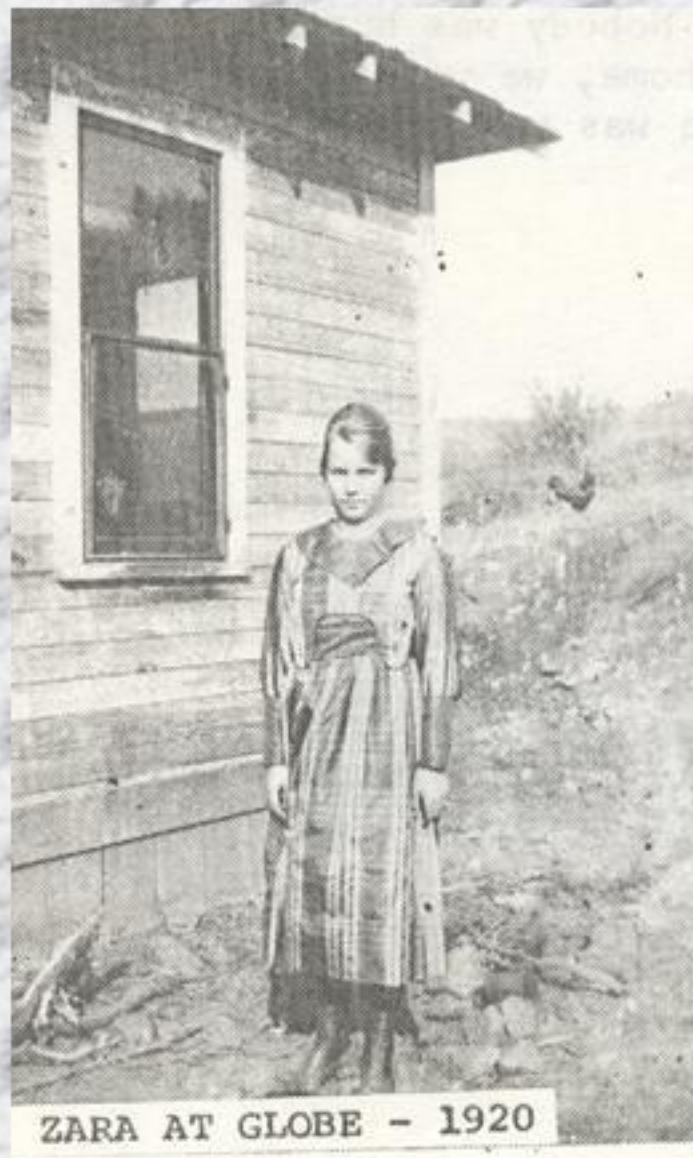
ZARA AT GLOBE - 1920